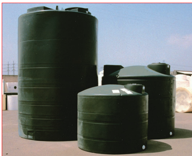
Rotonics has been a pioneer and, for the last three decades, a leading innovator in the manufacturing of all sizes of both Linear and Crosslink Polyethylene Tanks.