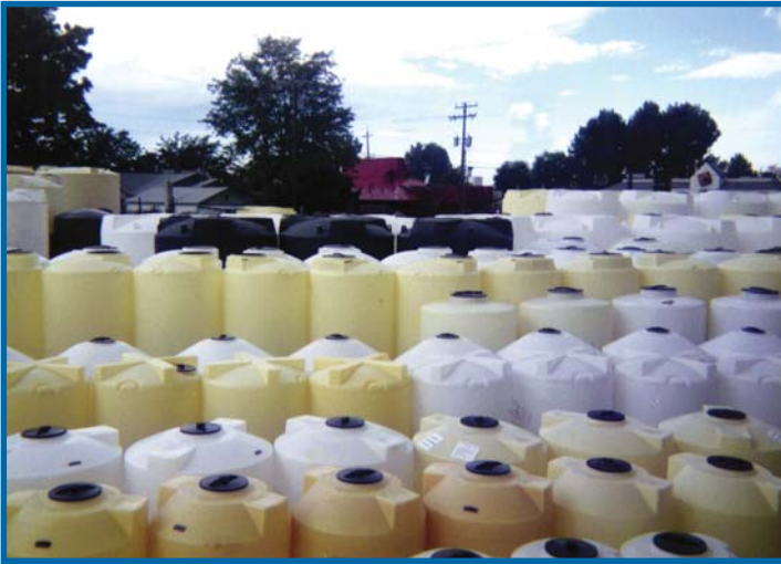
RMI has been a pioneer and, for the last three decades, a leading innovator in the manufacturing of all sizes of both Linear and Crosslink Polyethylene Tanks.