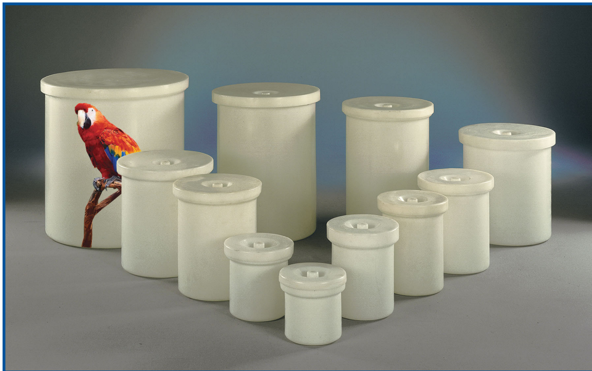
Multi-purpose storage containers for food, chemicals, or small parts.