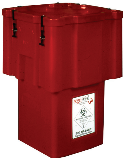
The 54gal. Super Mini is a high volume receptacle/collection container for areas where waste volume is high and space limited.