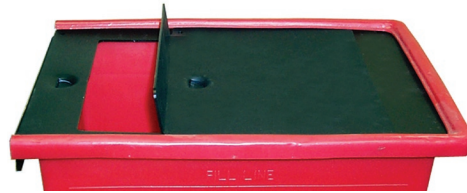
Lab Lid #601012