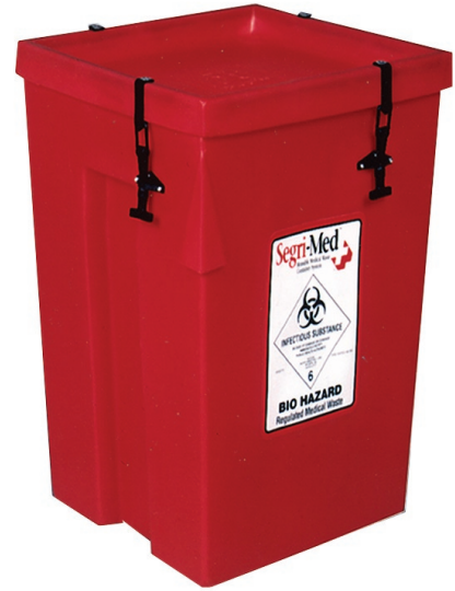
Mini container with standard locking transport lid. #601011