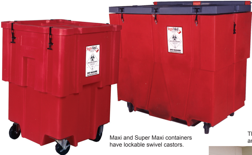
Maxi and Super Maxi containers have lockable swivel castors.

The Segri-Med® Maxi Container features built-in wheels and functions as a receptacle/collection container for bulk waste management. The Maxi is ideal for operating rooms, labor/delivery rooms, and other high volume areas.