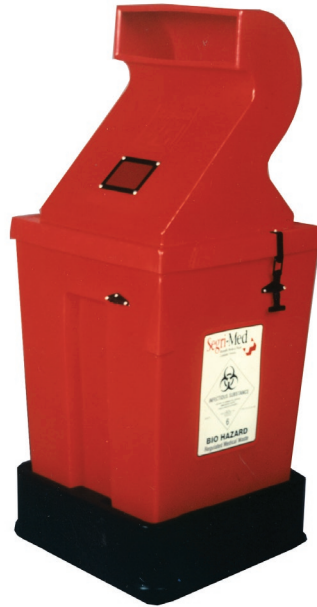
The Z-Lid offers restricted access for safe handling of volume sharps and IV tubing. It also eliminates "splash-up". #603912