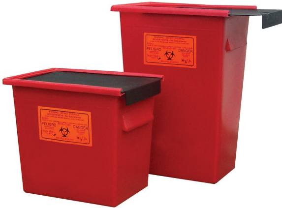
Locking Transport Lid #601011