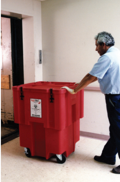
The Maxi containers are easy to transport.