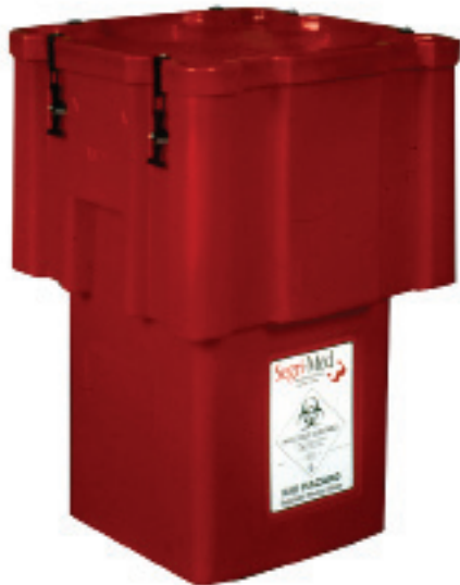
The 54gal. Super Mini is a high volume receptacle/collection container for areas where waste volume is high and space limited.