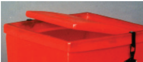
The hinged Hatch Lid allows easy access and waste disposal. #603913