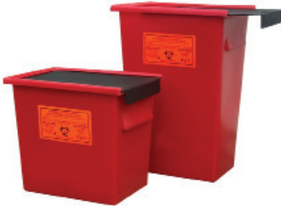
Locking Transport Lid #601011