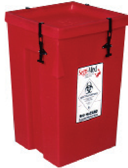
Mini container with standard locking transport lid. #601011