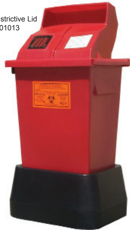
Single Dolly allows for quick and easy single container mobility. #60012 (39 gal)